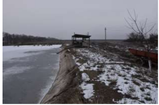
Cosnita village, r-nul Dubasari district. (IrrigationSystem)