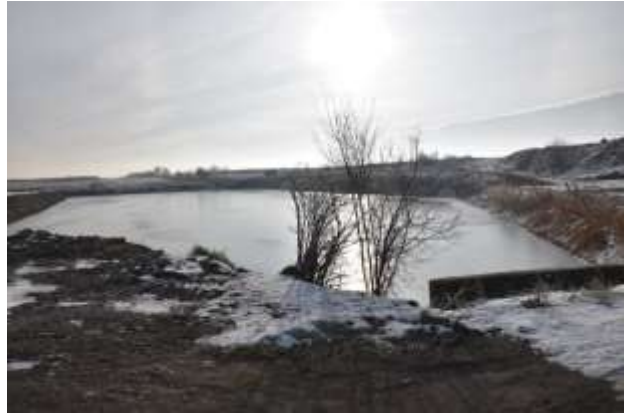
Grimancauti village, r-nul Briceni district (lake)