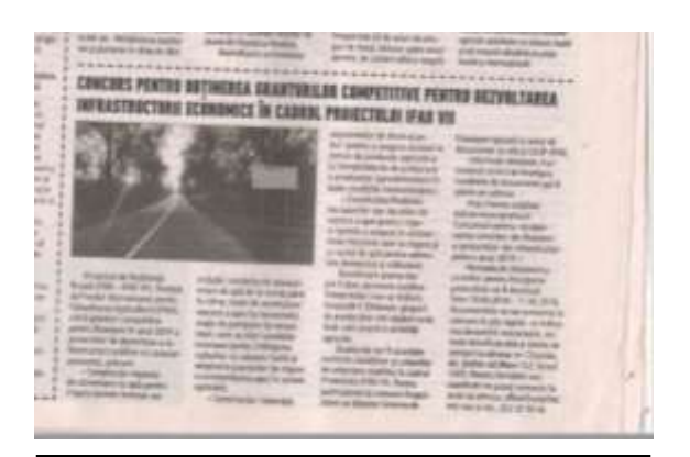
Agravista newspaper, issue number 8, from 18.05.18, Infrastructure