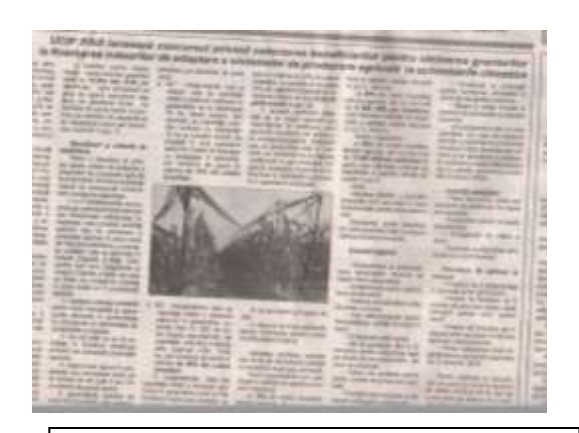
Gazeta Satelor newspaper, issue number 12, from 06.04.18, Improve smallholder and agribusiness adaptive capacity

Gazeta Satelor newspaper, issue number 39, from 19.10.18, a presentation of CPIU-IFAD offers and presence in autumn edition of Moldagrotech 2018