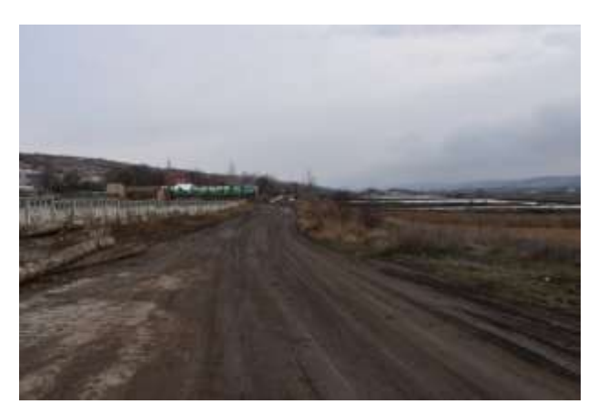
Costești, Ialoveni district (Construction of Road)

27.CPIU has prepared the terms of reference has announced a tender to select the consulting company that will prepare the feasibility studies for selected 7 localities. After final approval stage, at the beginning of 2019, CPIU will ensure the procurement of civil works and other related services for construction of infrastructure objects.