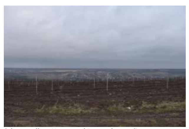
Saharna village Noua, r-nul Rezina district (Irrigation System)